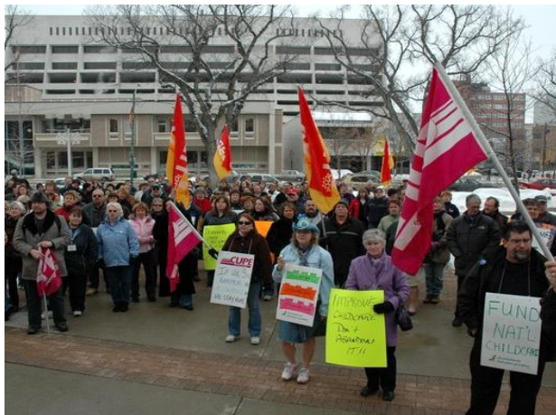
Saskatoon rallies for child care funding