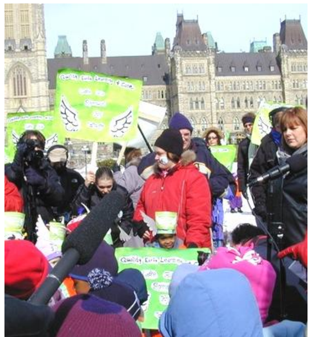
International Women's Day rallies across Canada focus on child care