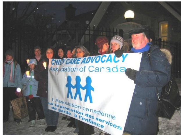
Vigil at Prime Minister's residence, February 2006

In 2005-06, child care advocates across the country mobilized to promote a national, high quality child care system. The events brought together parents, grandparents, child care staff, other child care activists, children, and local, provincial and federal politicians.