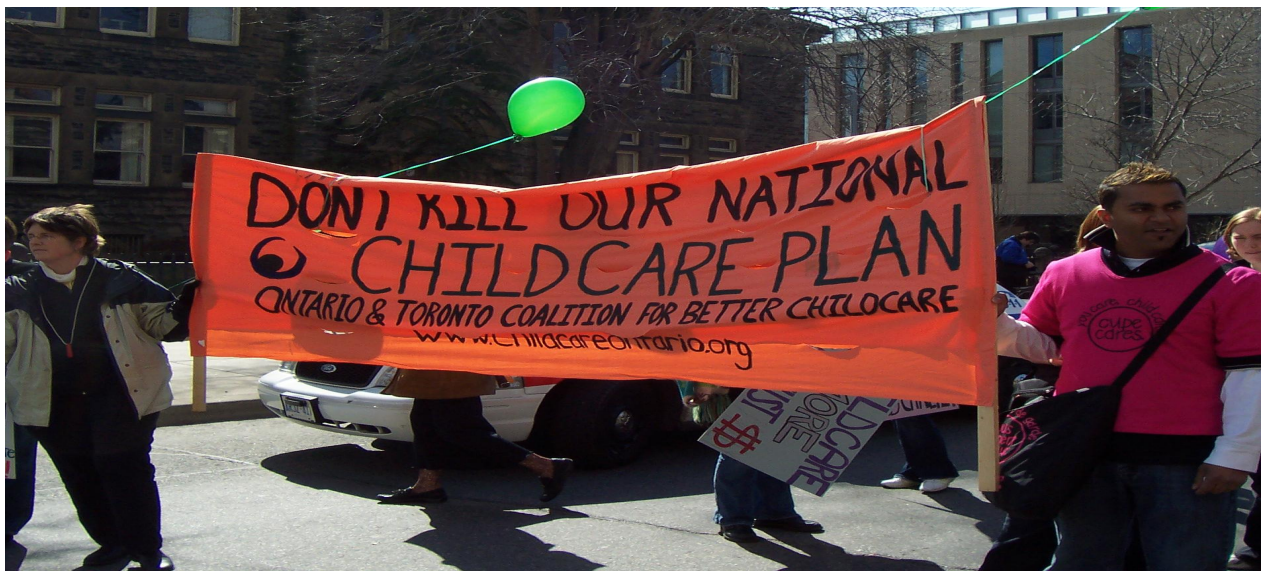
Toronto march draws 3,500