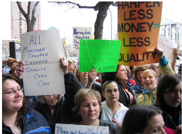
Supporting a quality system in Winnipeg